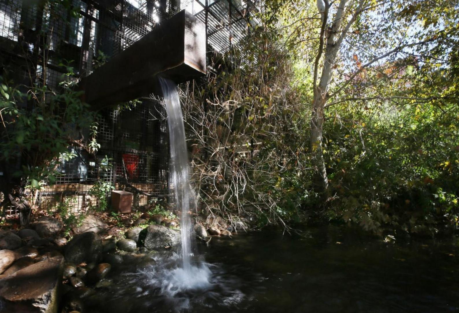
University of Arizona College of Architecture, Planning, and Landscape Architecture Underwood Garden