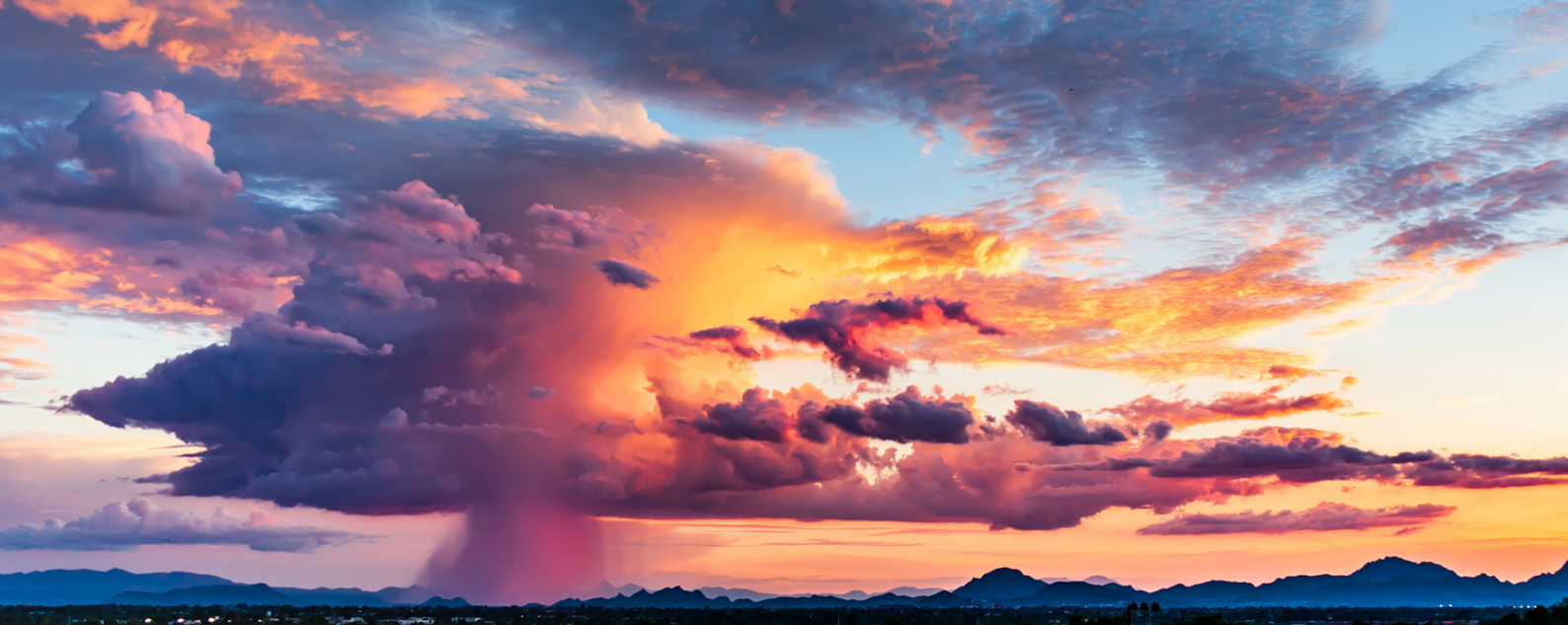
Monsoon Cloud Dropping Rain | | WRRRC 2022 Photo Contest Winner